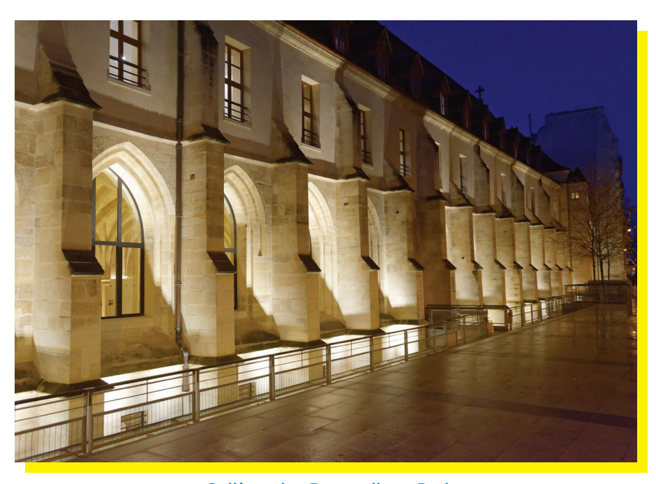
Collège des Bernardins - Paris