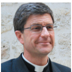
Monsignor Éric de Moulins-Beaufort (France)

Auxiliary bishop of the Paris diocese since 2006, he was ordained a priest for the Paris diocese in 1984. He holds a Master's degree in Theology. He is the President of the Collège des Bernardins, responsible for formation and is the director of the École Cathédrale. He is also the director of the Office of Vocations to Priesthood and Religious Life and President of the Episcopal Commission for Ordained Ministers and Laity in Ecclesial Mission.