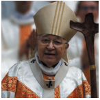
Cardinal André Vingt-Trois, Archbishop of Paris (France)

Archbishop of Paris since 2015, Ordinary of France Faithful of Eastern Rites, Pope Benedict XVI made him Cardinal on November 24 th , 2007. He is a member of the Congregation for Bishops, member of the Dicastery for Promoting Integral Human Development and a member of the section on Migrants and Refugees in this Dicastery. Cardinal André Vingt-Trois is also a member of the Congregation for the Clergy and of the Congregation for the Oriental Churches.